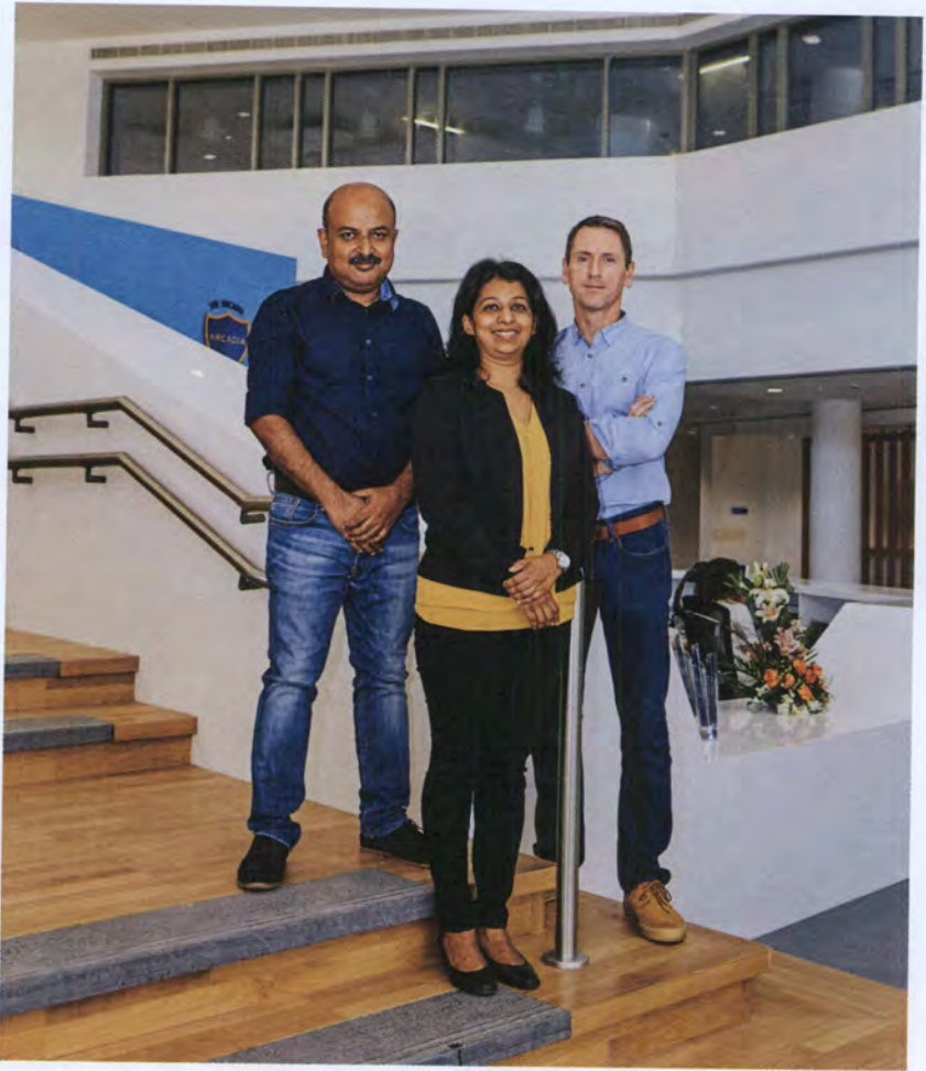
↑ The design team from Godwin Austen Johnson.

Natural rubber and hardwoods are principle flooring and surface materials to ensure minimal volatile organic compounds while bright colours ensure a vibrant ambience – although these are carefully used in order to prevent